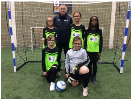
Congratulations to the Y5/Y6 Futsal team who made the semi-final in a recent Hull Active School Tournament.